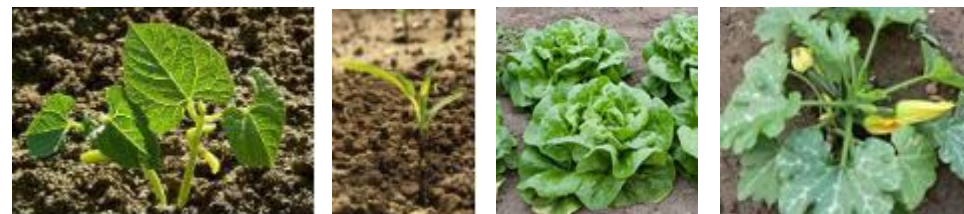
New main crops (bean, maize, and ...)