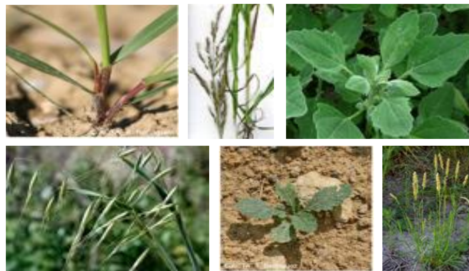
New main weeds plants