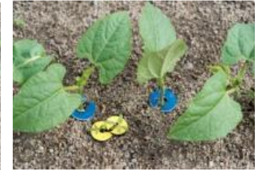
Crops & weeds markers