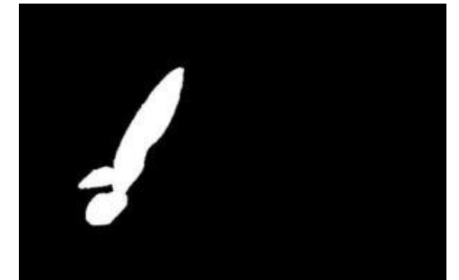
Hypothesis : Mask return