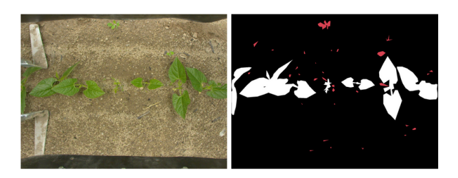
Fig. 3. Example of image segmentation.

the final result depends both on these individually and on system-level properties of the robot such as integration between functionalities ( Intra-row weeding , Crop mapping )