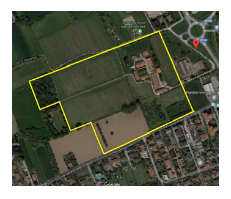
Fig. 5. The experimental farm of Università degli Studi di Milano in Cornaredo, where the 2nd ACRE Field Campaign will take place in June 2022. The image shows an area of 800 m x 700 m approximately.

of METRICS. Figure 3 illustrates the image segmentation problem that participants are asked to tackle.